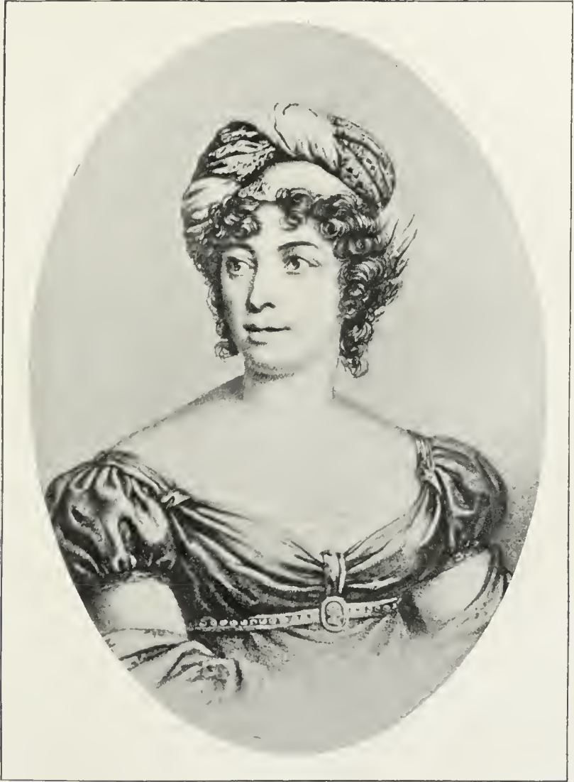
MADAME DE STAËL.